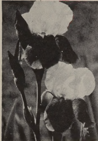
HELEN COLLINGWOOD Light violet standards and dark violet falls